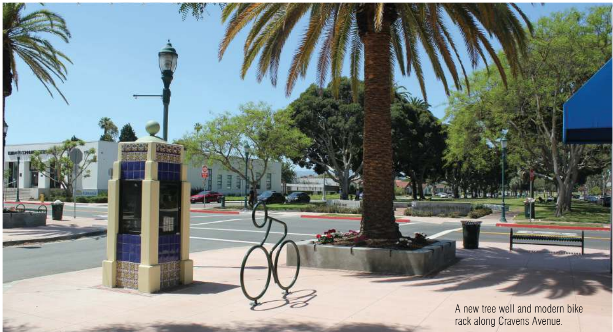
A new tree well and modern bike rack along Cravens Avenue.

W hen the City of Torrance, Calif., decided it was time for a facelift to a section of Cravens Avenue in the historic downtown area, it was much more than a simple repaving project. The area, affectionately known as “Old Torrance,” was designed in 1912 by Frederick Law Olmsted, Jr., making the street more than 100 years old. There also were significant sidewalk issues that presented safety hazards, so it was time for a major refresh. The city’s vision was to create an “inviting and more unified