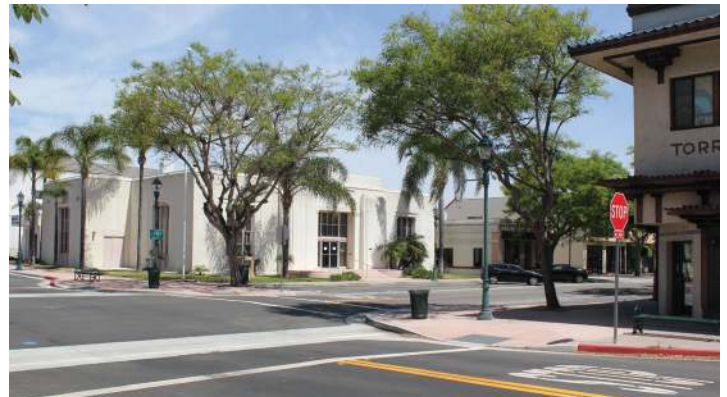
Improvements to pedestrian walkways, ensuring safety while maintaining the town's charm.

Cruikshank emphasizes that the software JMC2 used isn't only viable for large organizations or projects. "We have completed hundreds of small-scale projects using MicroStation and other Bentley applications," he says. "I've recommended these