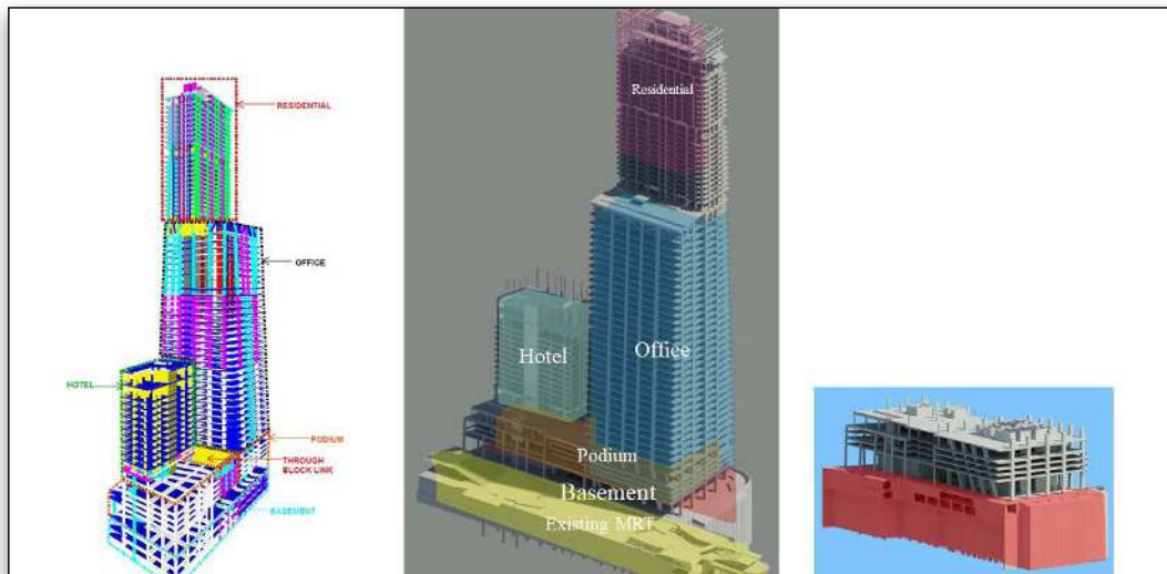
Guoco Tower 3D Renderings and Visualizations

Construction on the Guoco Tower complex finished in 2016, and the tower has become one of the landmark structures in Singapore. Work on this project demonstrated how geotechnical applications and other advanced technology can drive engineering innovation. Arup Singapore’s analysis and design work is expected to serve as a reference point for similar developments in the future.