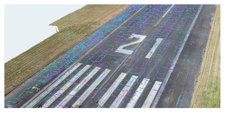
The pavement crack detector technology saved 75% in onsite manual data collection.