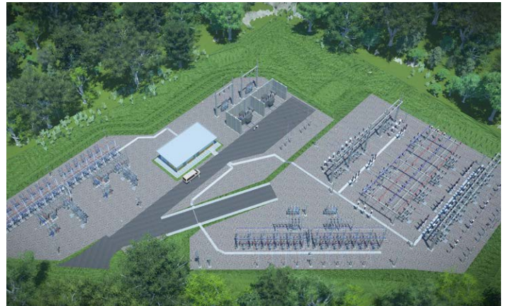
Switching to 3D design lowered development time for the mechanical elements of electrical substations by 50%, or 225 work hours.

Designs have also become more accurate, as the design environment cross-references information from civil, electrical, and electro-mechanical designs in real time while minimizing errors caused by manual input. These enhancements prevent unnecessary use of resources and result in more sustainable designs. Since each of the digital designs contain information for maintenance and operations, COPEL can use them to improve asset management.