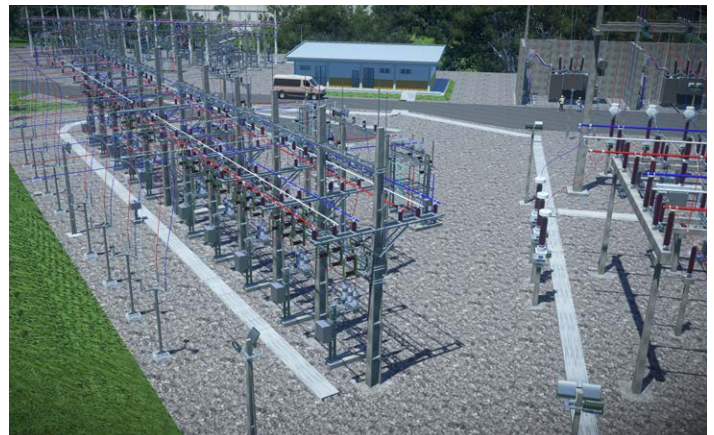
Development time for electrical elements has fallen by 30%, or 195 work hours.