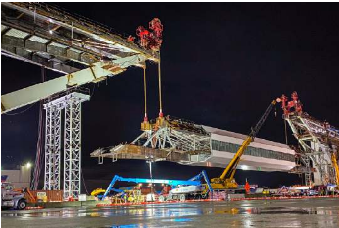
Clark Construction had to remotely construct the 3-million-pound span structure, transport it three miles amid a busy airport, and hoist it 85 feet to connect to pier supports.

Additionally, to meet the Port of Seattle’s request for a data-rich BIM deliverable, Clark began incorporating the necessary digital tools and data from the very beginning of the design process. Using interoperable applications early in the project, they seamlessly delivered a digital twin with 18 standard attributes per asset, that the client will also later use for facilities management and ongoing operations of the airport. This world-class expansion project sets a benchmark for digitalization in the industry. “The USD 968 million Sea-Tac International Arrivals Facility is a model for how digital tools can enhance the design and construction of our nation’s most critical and complex infrastructure projects,” concluded Krause.