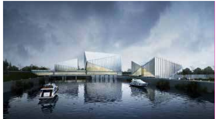
They developed a connected data environment in ProjectWise, allowing all participants and stakeholders to work collaboratively by designing components of the project simultaneously.