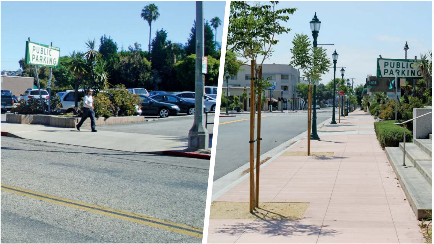
A view of Cravens Avenue showing a public parking area before and after improvement of the pedestrian walkway.