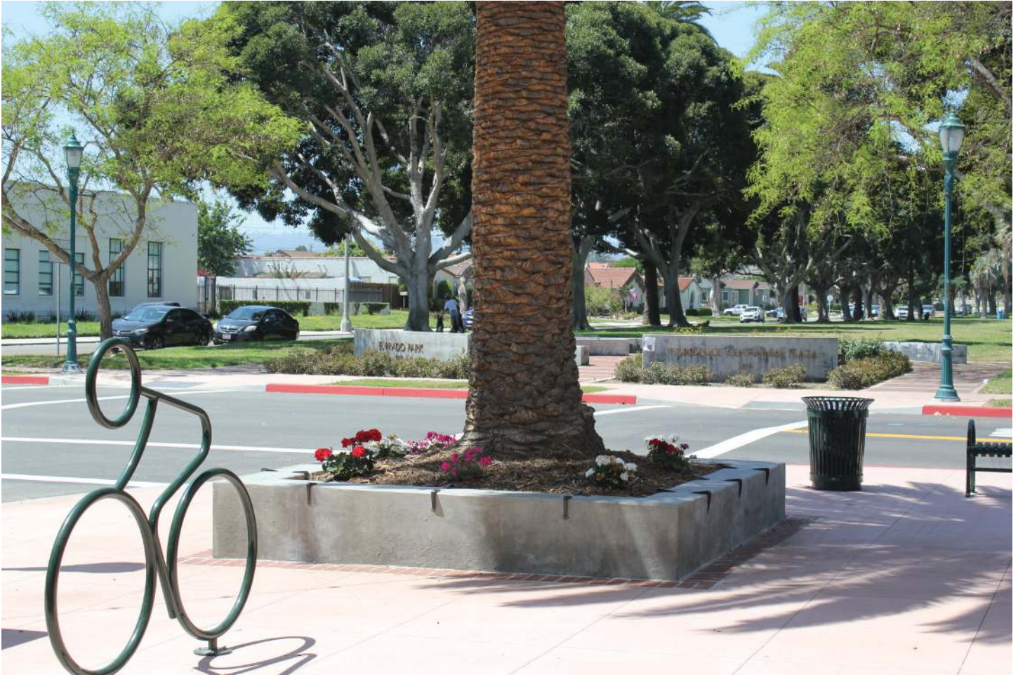
Shown are a new tree well and bike rack along Cravens Avenue.

W hen the City of Torrance, California decided it was time for a facelift to a section of Cravens Avenue in the historic downtown area, it was much more than a simple repaving project. The area, affectionately known as “Old Torrance,” was designed in 1912 by Frederick Law Olmsted, Jr., making the street over 100 years old. There were also significant sidewalk issues that presented safety hazards, so it was time for a major refresh. The city’s vision was to create an “inviting and more unified pedestrian atmosphere” along the section of Cravens between Torrance Boulevard and Carson Street — while bringing the area into compliance with current Americans With Disabilities Act (ADA) standards.