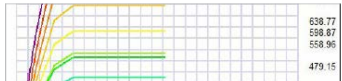
p-y curve generation for lateral analysis of drilled pier.