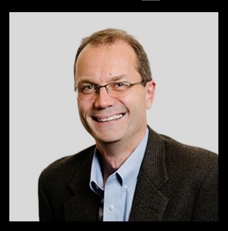
Download content here