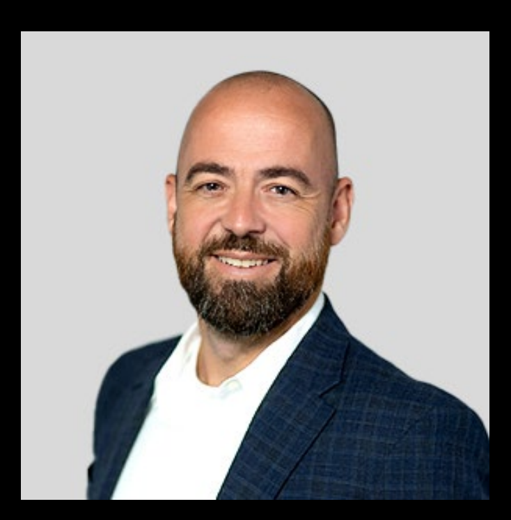
Download content here