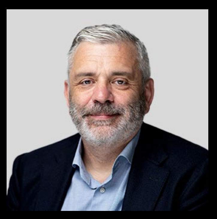
Download content here