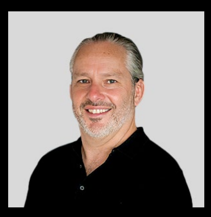
Download content here