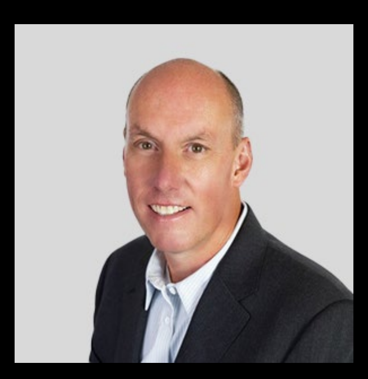
Download content here