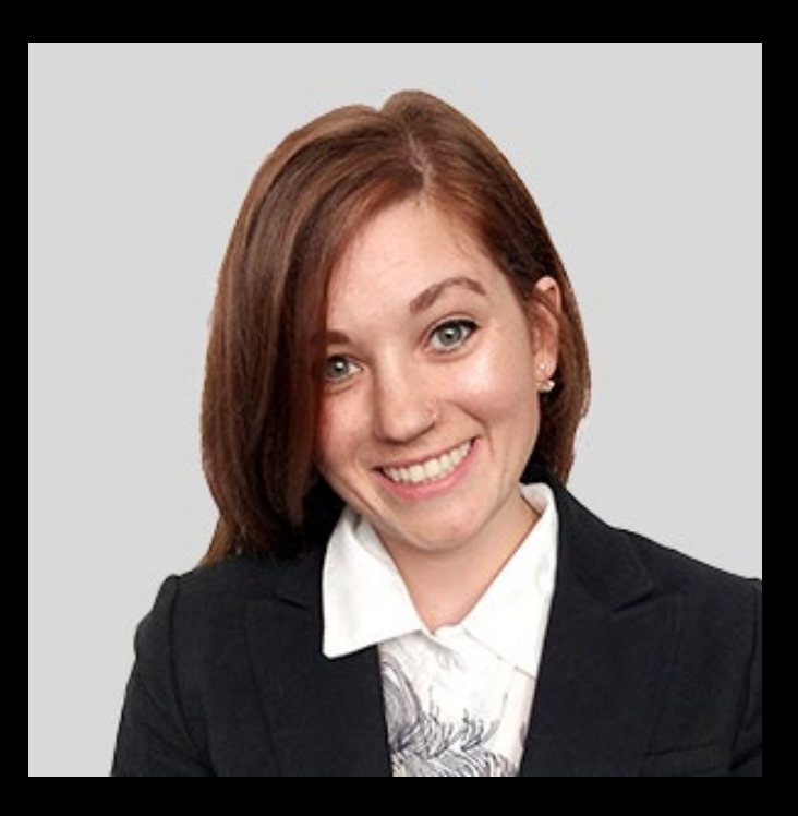
Download content here