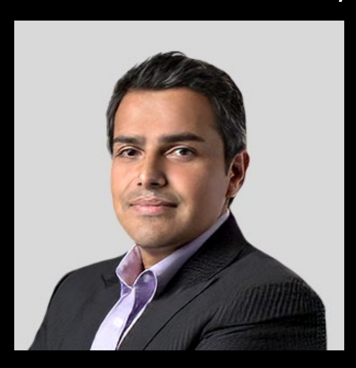
Download content here