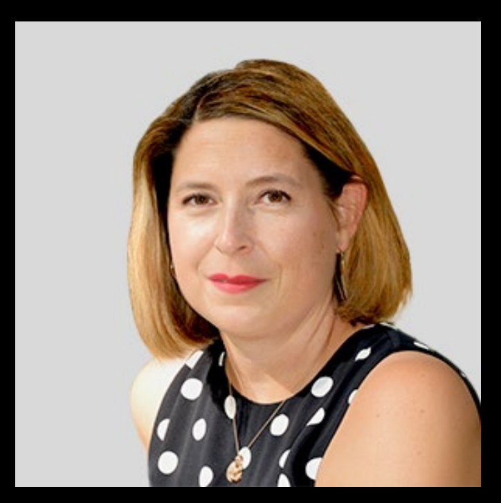
Download content here