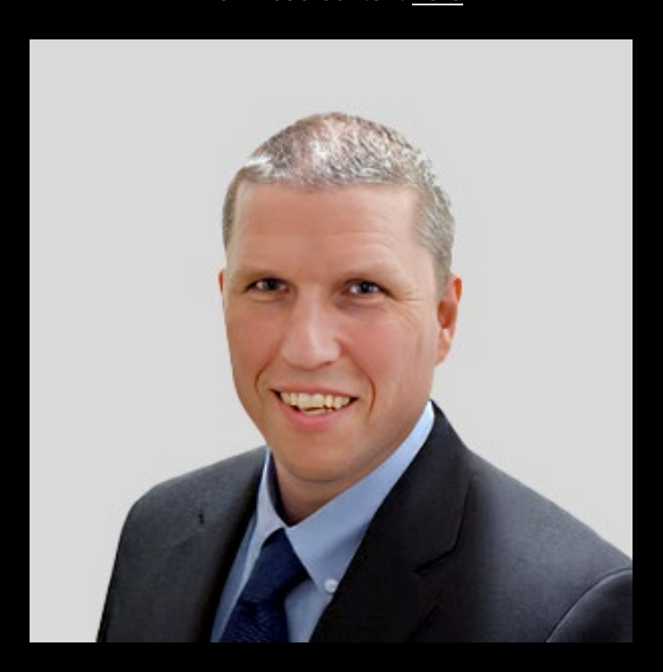
Download content here