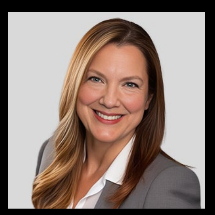
Download content here